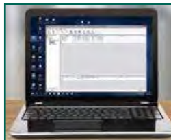
pc programmable easy to use software included