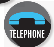
voice and remote programming use DKS service options for connection and programming