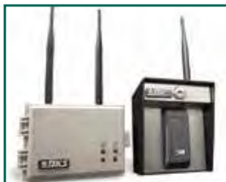
wireless expansion up to 24 entry points