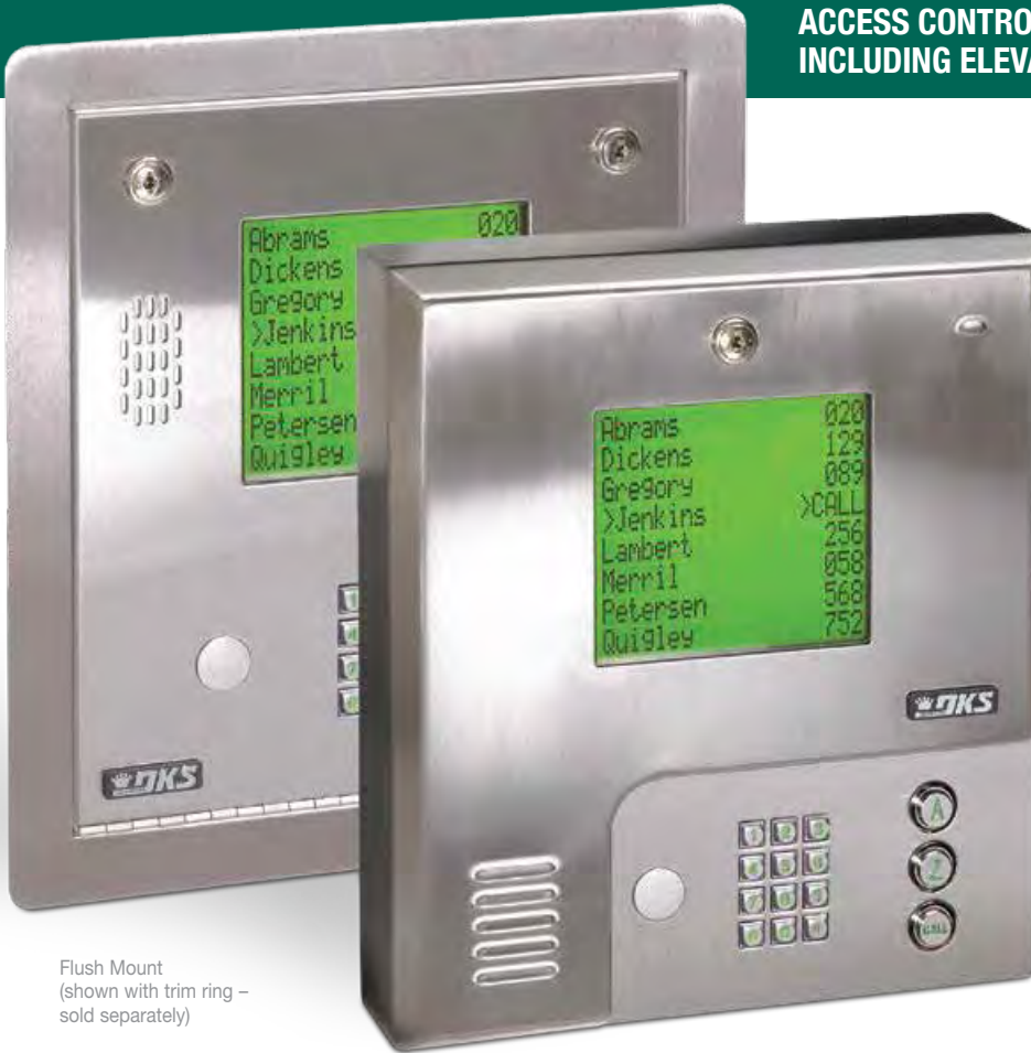
Flush Mount (shown with trim ring - sold separately)

BEST SUITED FOR APPLICATIONS REQUIRING COMPLETE ACCESS CONTROL FOR UP TO 48 ENTRY POINTS, INCLUDING ELEVATOR CONTROL