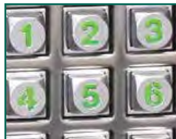
internal LED lit keypad and A-Z-CALL buttons