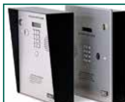
two mount styles surface and flush are available