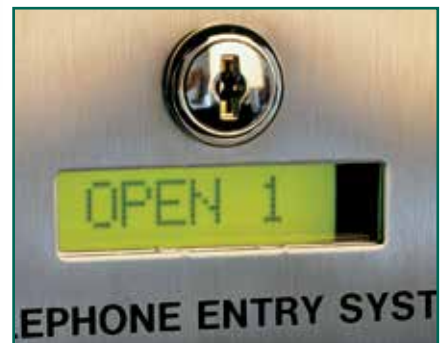
built-in display indicates door/gate has been opened