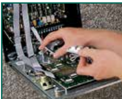
modular design makes installation and service easy