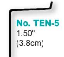
No. TEN-5 1.50" (3.8cm)