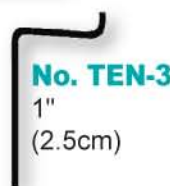
No. TEN-3 1" (2.5cm)