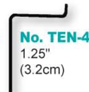
No. TEN-4 1.25" (3.2cm)