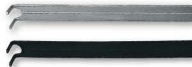
No. TEN-7 (Zinc Plated, Medium Tension)

These tension tools are for use on double-sided locks such as automotive door locks, furniture, cabinets and other cam locks.