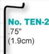
No. TEN-2 .75" (1.9cm)

These tools are designed for use on lever-type letterbox locks. They apply tension on the levers, while moving the levers to the shear line, opening the lock.