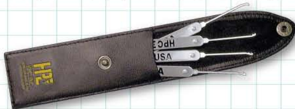
Stainless Steel Extractor Set No. ES-2000

The Stainless Steel Extractor Set is the ultimate in broken key removal. The tools are designed to slide next to broken keys along the side of the mill and ride along the bottom pins to hook into a cut in the key. They are made of high grade stainless steel and can be bent to reach around many obstacles. Comes in a genuine leather case with snap closure, measures 1.75" x 5.5" (4.5 x 14cm). (No. PIP-CASE Case only)