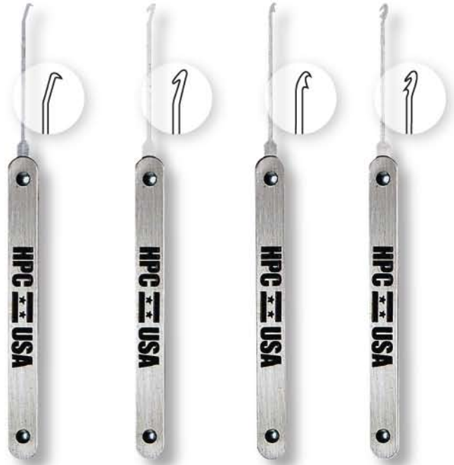
No. SSX-10 (.020 thick) No. SSX-11 (.020 thick) No. SSX-20 (.020 thick) No. SSX-21 (.020 thick)

The Stainless Steel Extractors are strong, yet flexible. This allows them to be bent and twisted in the lock without breaking. They are available in single- or double-barb, curved up or down.