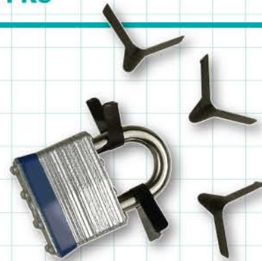
Padlock Shim Pick Set No. PSA-20