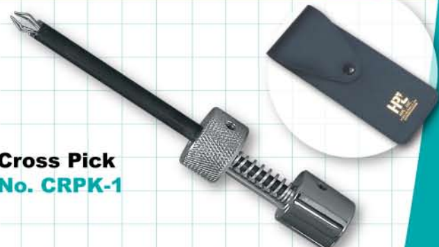
Cross Pick No. CRPK-1

The Cross Pick is designed for 4-way cross locks. With the removal of one pin, it can also be used on 3-way cross locks. These locks are used on office furniture and other cam lock applications and the Cross Pick is the only choice for bypassing them. A genuine leather case is included. (No. COMP-CASE).