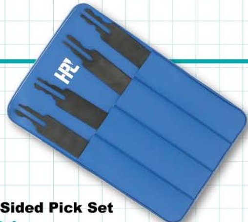
Double-Sided Pick Set No. DSP-1

The Double-Sided Pick Set is designed specifically for use on double-bitted cam locks. The set contains 4 picks which provides 8 different configurations. These picks will quickly defeat the most popular double-bitted wafer tumbler cam locks, commonly found on glass showcases, office furniture and some cash boxes. A plastic storage case is included. Measures: 5.375" x 3.5